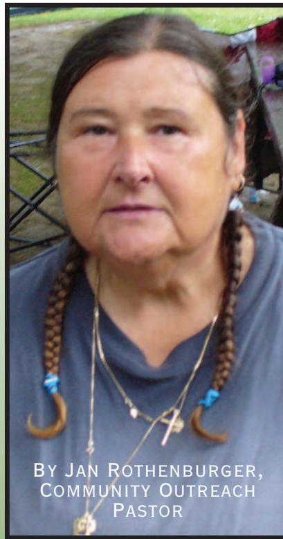
BY JAN ROTHENBURGER, COMMUNITY OUTREACH PASTOR

The pay phones are busy in jail on Christmas Day and fights over phones are common. Inmates can only make collect calls; they are timed and cut off after so many minutes.