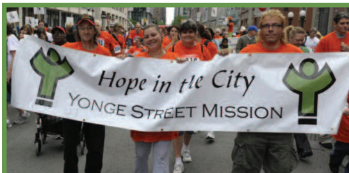
Toronto Challenge 2010 participants included one YSM senior using her walker, accompanied by her granddaughter.