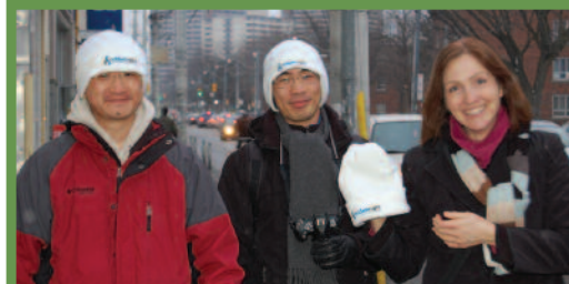
"Your cold, hard cash warmed up my cold, tired feet!"

In the meantime, read on for your other chances to walk or run for YSM.