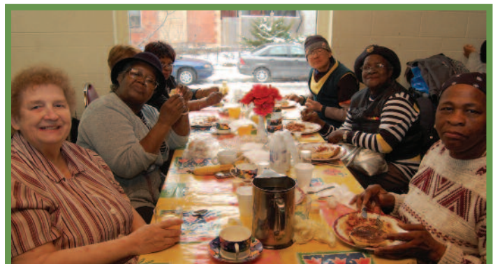
"It is wonderful to have such a good meal with all our friends here," said seniors at their Easter lunch. Thank you, generous donors, for helping us celebrate new life and hope by providing meals, and sending back meal tickets and placemats to grace the Easter tables.