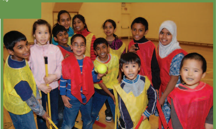
A group of energetic children thoroughly enjoy March Break activities at the Community Centre's gym. A one-week camp at the Computer Lab and activities in St. James Town and Regent Park entertained about 200 during school break.