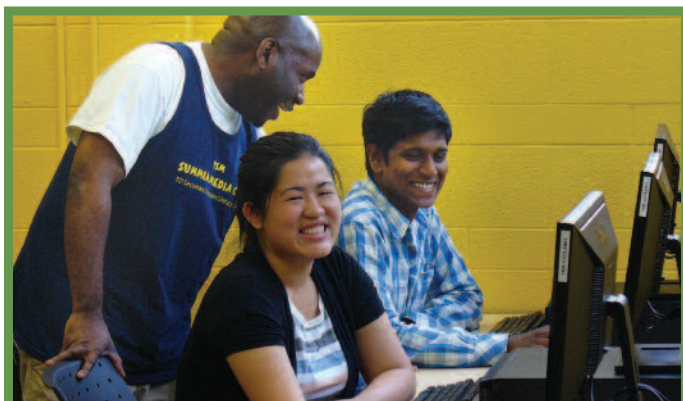
A 16-station computer lab opened in the Community Centre in June. Toddlers, seniors and teens all love the new space. Thanks to Green Shield Canada for donating the new equipment.

Thanks to the generous donors who supported our Infrastructure Stimulus Fund projects, the Community Centre now has newly renovated program space. A wonderful multi-purpose room on the second floor accommodates meetings of community members, seniors' art classes, one-on-one counseling and children's activities.