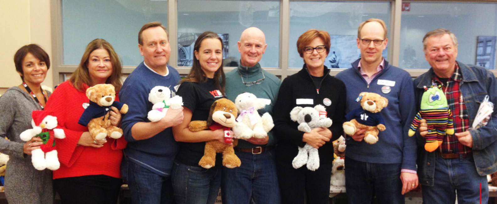
YSM Board of Directors volunteering at our 2018 Christmas Toy Market