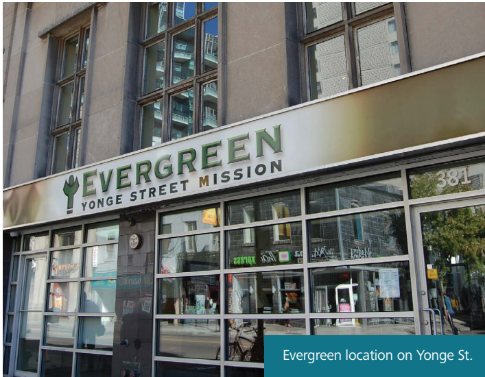
Evergreen location on Yonge St.

TRANSFORMING TORONTO SINCE 1896 VOLUME 18 / ISSUE 8 WINTER 2016