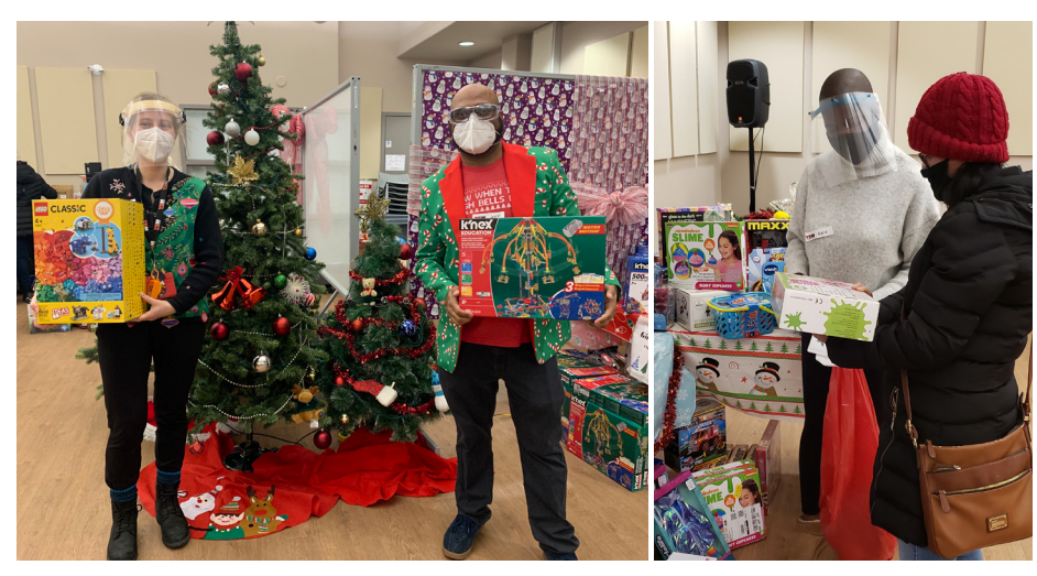
Santa's YSM elves made the Toy Market joyful while helping hundreds of families pick out sure to be loved gifts.

For the first time, we were also able to have a draw for a number of video