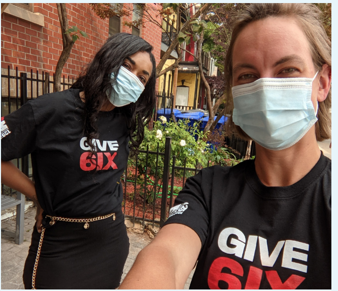
Offer hope to those in need by joining and inviting your community to

The possibilities are endless! So what's your 6IX? Get inspired and learn more at ysm.ca/GIVE6IX