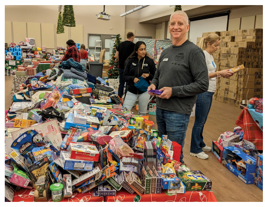
Volunteers from ReSource Group Canada happily worked to offer Christmas joy to neighbourhood families served by YSM's Toy Market

Christmas can be a magical joyful season filled with surprises, celebration and community.