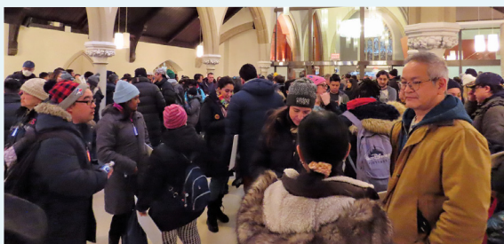
CNOY participants gather inside St. Paul's Bloor Street, as they prepare to brave the cold night and walk in support of YSM.

We are excited to announce our Coldest Night of the Year (CNOY) 2023 community fundraising walk raised a new record of $172,650, surpassing our $160,000 goal!