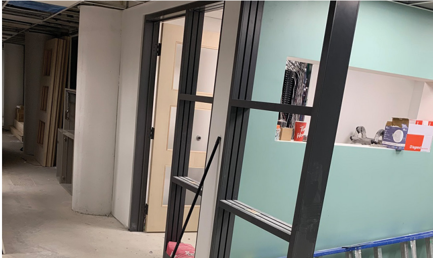
While it may not look like much yet, our much expanded Health Centre will dramatically expand the care we can offer street-involved youth.

After completing our $3 million Evergreen Health Centre redevelopment campaign, construction was soon underway of our brand new, purpose-built health centre, which will be completed in July!