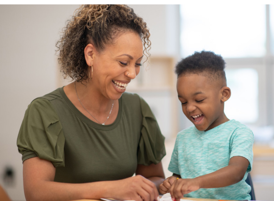
YSM's reunion space aims to support and strengthen families with Children's Aid Society of Toronto involvement.

Since January, YSM's Cornerstone Family Services has been piloting an innovative program with the Children's Aid Society of Toronto (CAST) to provide an onsite reunion space where our staff supervises visits between Children's Aid Society involved children and their parents.