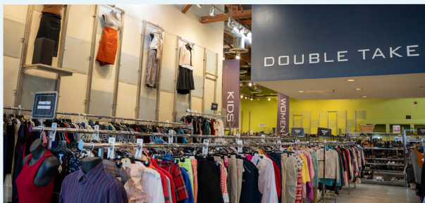
YSM's Double Take store: source of sustainable fashion, great deals, professional clothing and retail training

Looking to clean out your closet? Consider donating your gently used clothing to YSM's Double Take thrift store.