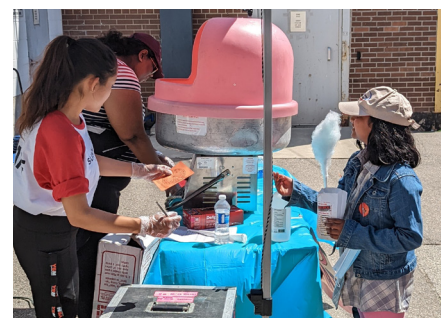
A young community member enjoys a special treat at YSM's Cornerstone family carnival!