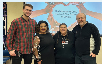
Our CATM team will offer special services and festivities.

CATM will offer a special Christmas eve service filled with reflection and gratitude, as the cornerstone of our Christmas celebrations. We extend a warm welcome to all. Learn more about Church at the Mission at linktr.ee/churchatthemission .