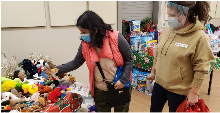
Parents browse the Toy Market to ensure special holiday surprises for their kids.