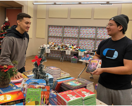
YSM's Toy Market brought holiday joy to 950 children.

For some, Christmas brings financial pressure, loneliness and the weight of unmet expectations. Through your generosity, YSM was able to bring extra joy and transform holiday expectations for our community members in the following ways.