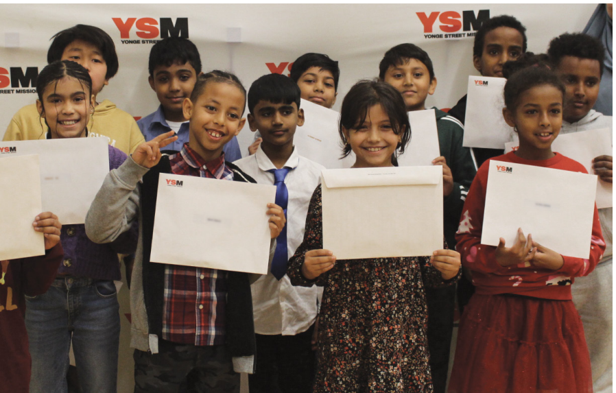
Last December, YSM's Computer Literacy Centre celebrated 54 new graduates.

Today, our computer centre continues to keep its students ahead of the curve — growing to include classes in robotics, coding, graphic design, game development, and more. About 300 children and youth participate weekly, and about a thousand participate annually in the CLC's camps, March break or professional advancement day programs, and school visits.